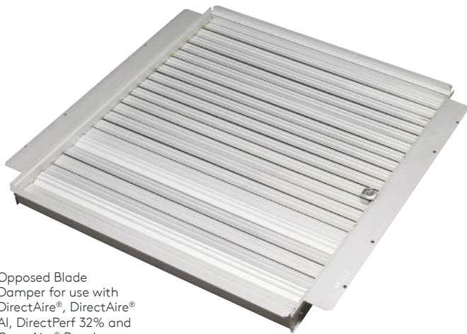
Opposed Blade Damper for use with DirectAire®, DirectAire® AI, DirectPerf 32% and GrateAire® Panels

Tate's Single-zone Opposed Blade Damper offers a dramatic airflow improvement over traditional manual slide dampers. It features a nearly infinite range of adjustment and very little airflow resistance. Easy access through the panel's surface allows for quick adjustment of airflow balancing to IT hardware.