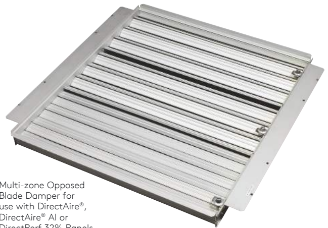
Multi-zone Opposed Blade Damper for use with DirectAire®, DirectAire® AI or DirectPerf 32% Panels

Tate's multi-zone opposed blade damper enables the airflow delivery to be balanced based on the specific load in the rack. The damper allows data center operators to individually adjust airflow to three zones within the rack – top, middle and bottom.