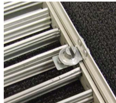
Quarter Turn Adjustment for precise setting of airflow