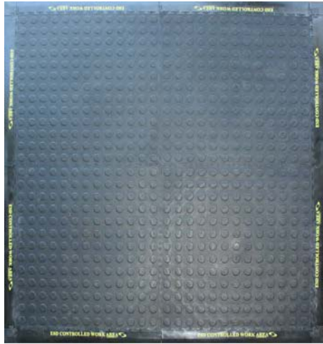
Conveniently Configured with Edging for Mats