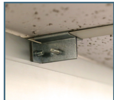
Back Side of "P-Clip"