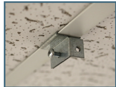
"P-Clip" for T-Bar Mounting