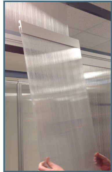
Panels Used To Fill Empty Rack Spaces